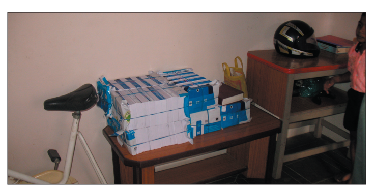
Herald Magazines just brought in from the printer

by the Sangiliyandapuram (Trichy) ecclesia with 500 copies printed and distributed every other month. In addition, The Dawn magazine is now being translated and 500 copies distributed monthly by the Manaparai (Trichy) ecclesia.