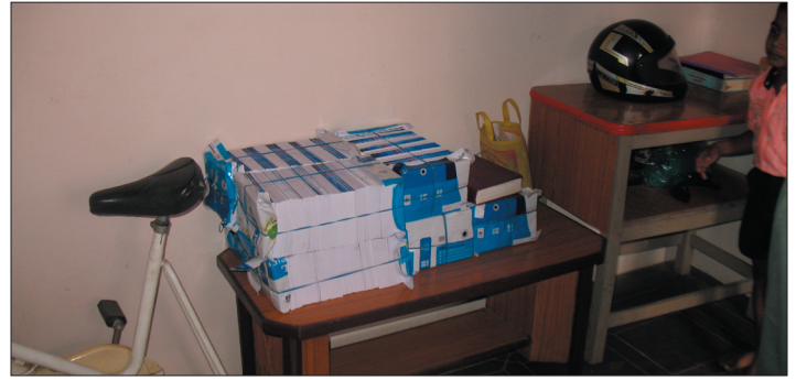
Herald Magazines just brought in from the printer

by the Sangiliyandapuram (Trichy) ecclesia with 500 copies printed and distributed every other month. In addition, The Dawn magazine is now being translated and 500 copies distributed monthly by the Manaparai (Trichy) ecclesia.