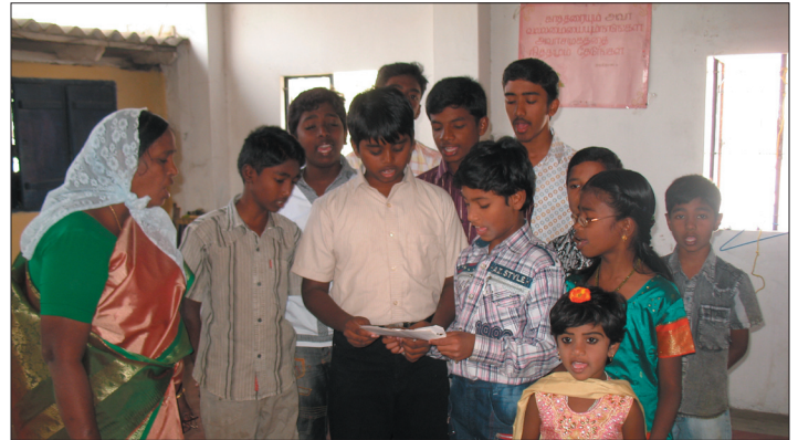
Coimbatore children’s class

On Sundays, sisters conduct children classes for the children from ages 2 to 15. Once in a while, the children give presentations about what they have learned to the ecclesia in special one-day, or half-day, conventions.